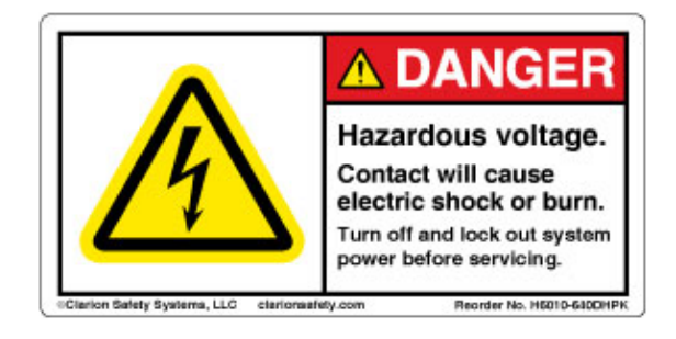
Figure 1: Example of an ANSI Z535.4 electrical hazard product safety label. (Design ©Clarion Safety Systems. All rights reserved.)

Designing effective systems of safety labels is a task that brings together a wide range of information and distills it down into a series of easily understood messages. The standards-based building blocks of a safety label risk communication system (see Figure 2 ) must be properly assembled in ways that make sense for your company's products, its audience, and its market. It's also necessary to understand that creating an effective product safety label system is a job that is not done just once. Labels must be periodically reevaluated in light of changes to standards, the standardization of new symbols for specific safety meanings, and the latest available product safety and accident information related to your company's products and its industry. Thoughtful reconsideration must be done recurrently to achieve the goal of effective product safety communication aimed at reducing risk and protecting people from harm.